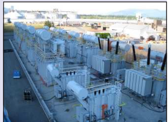
All 16 transformers in storage at the wharf.