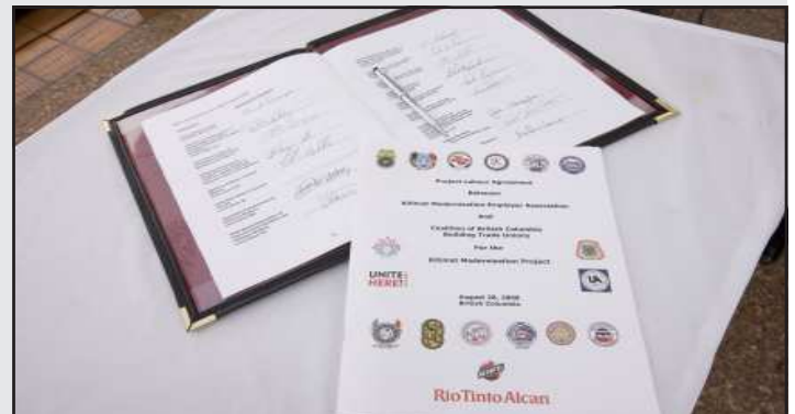
Below: PLA - signed, sealed and delivered.